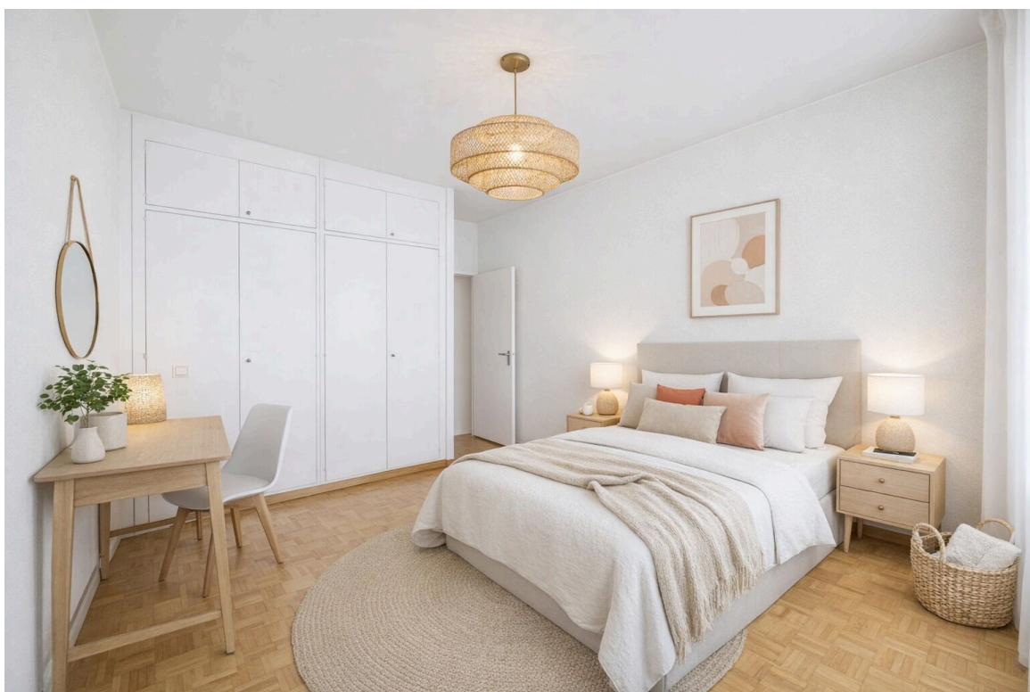
Image de synthèse